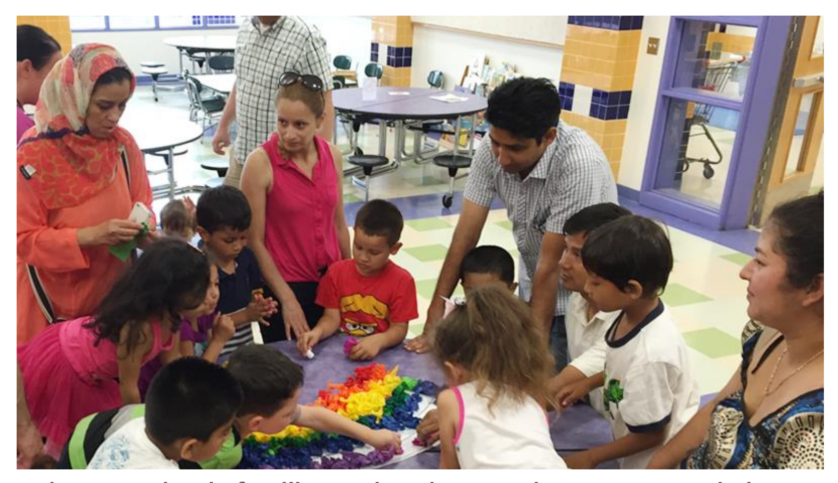
educate and train families so that they may better support their students to achieve at high academic levels